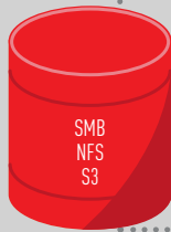
2. NFS OR SMB BASED FILED SYSTEM