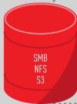
2. NFS OR SMB BASED FILED SYSTEM