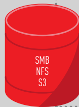
2. NFS OR SMB BASED FILED SYSTEM